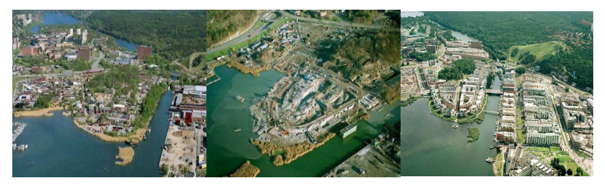
FIGURE 2: Hammarby Sjöstad in Stockholm.

It is a district near the city center which has been chosen as a site undergoing sustainable development; it is located in the southern part of the city and is located along the lake (Sjo) Hammarby and its name means "City waterfront in Hammarby" (Hammarby Waterfront Town) (Figure 2). Industrialization, born initially as an agricultural area, began to be present only towards the end of the nineteenth century, given its strategic position with the city center. During those same years, particularly from 1917 onwards, Hammarby Sjöstad underwent several urban interventions that made it more and more fertile territory for investments, such as the construction of a canal to connect the city to the Baltic Sea or even lines of railways to promote heavy industry (e.g., General Motors, Luma bulbs).