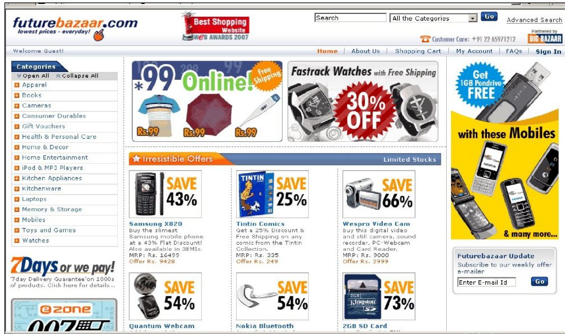
FIGURE 3: Homepage of http://www.futurebazaar.com