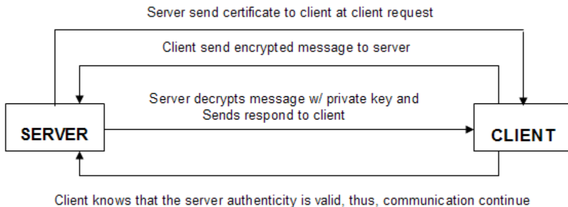
FIGURE 1: SSL Algorithm.

In SSL, communication between the server and the client is encrypted using their certificates. This encryption creates virtual information that is not hackable by others. The steps of how SSL works is shown in the following diagram: