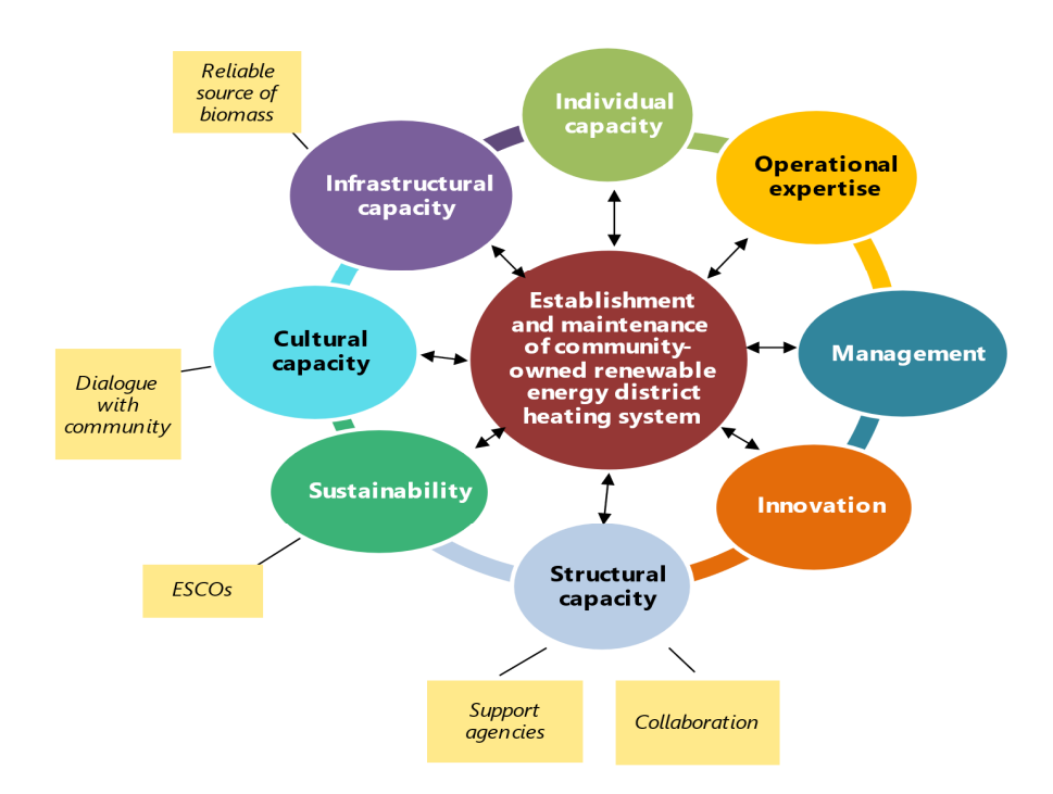
FIGURE 2: Theoretical framework incorporating research findings.

The research findings allude to community-owned renewable energy district heating initiatives encountering a number of challenges. Therefore, resilience within the governance structure of these initiatives could be included as a component of the theoretical framework.