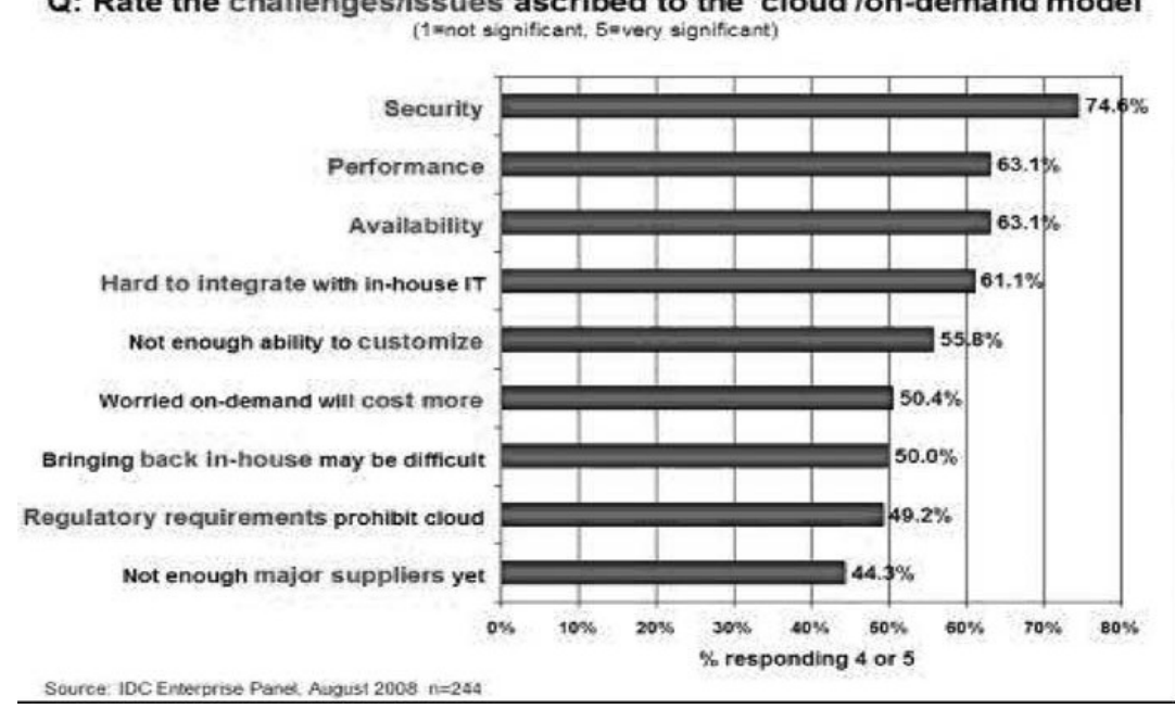
Q: Rate the challenges/issues ascribed to the 'cloud'/on-demand model