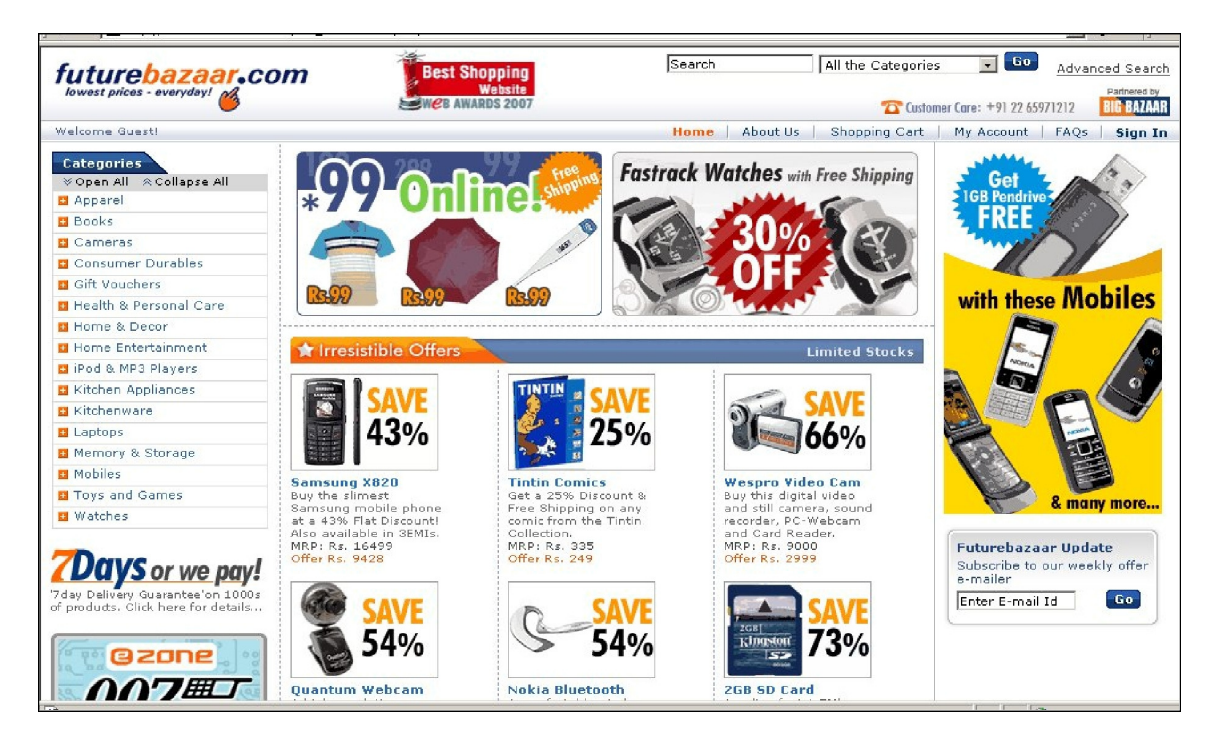
FIGURE 3: Homepage of http://www.futurebazaar.com