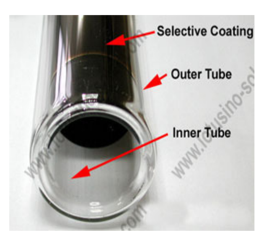
FIGURE 1: Evacuated glass tubes