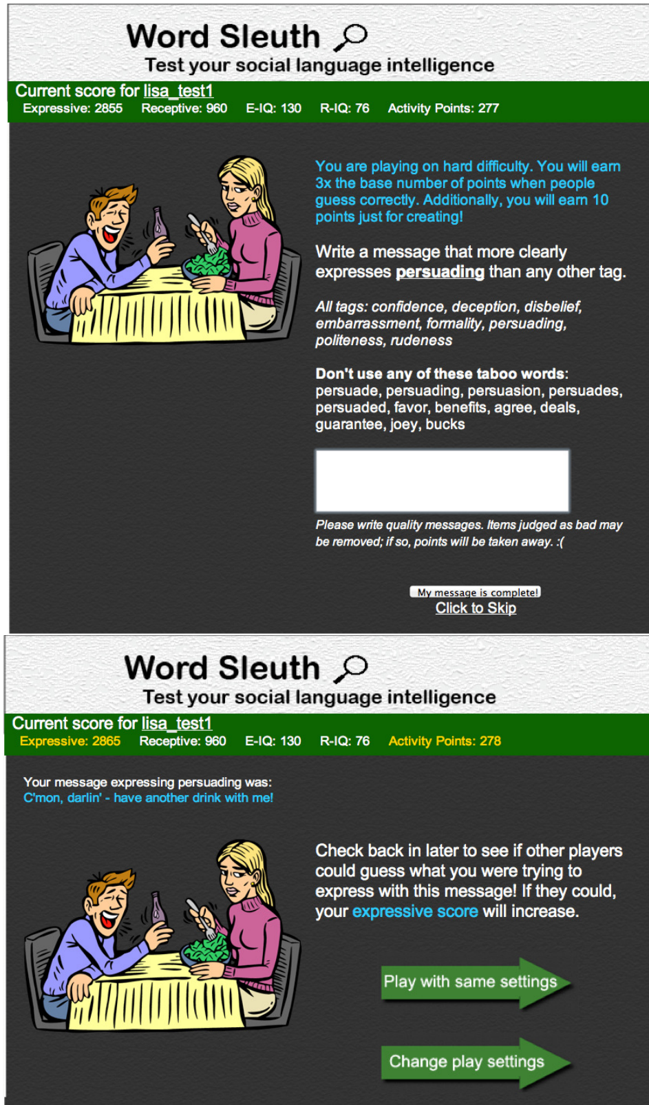
FIGURE 1: An Example of Expressor Game Play.