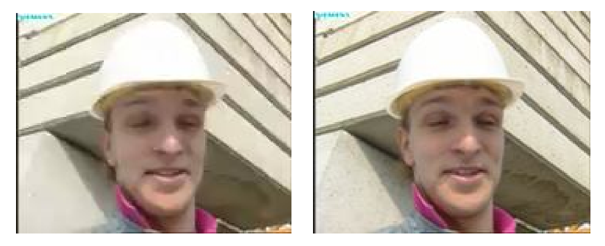
FIGURE 3: RECONSTRUCTED IMAGE

Two encoding schemes, i.e. high complexity and low complexity algorithm, were implemented and evaluated. Performance evaluation of the encoded video is based on subjective survey and objective evaluation. Subjective survey is based on the personal opinion and objective evaluation is based on the calculation of BDBR, BDPSNR, and Time Saving. BDBR is value of different bitrate, BDPSNR is the different value of PSNR and the Time Saving shows the computation time between the high complexity and low complexity [21].